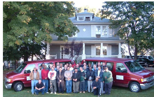
Capital Heights, Maryland, Teen Challenge Center with New Vans furnished by Kingdom Investors